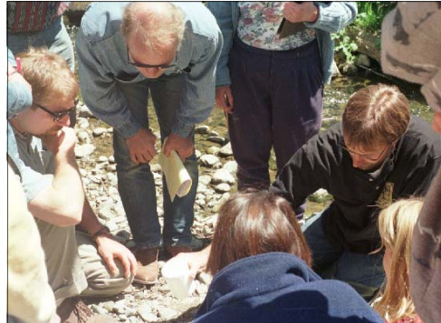
RCD-Sponsored Stream Care Workshop

We have technical expertise, manpower, and funding available to work on projects on private and public lands. We can help you obtain expert advice on how to best accomplish a project you are considering for your land. If your project fits within the guidelines of one of our funded problems, then we may be able to assist with the cost of the project. However, we only become involved in projects at the invitation of the landowner. You are free to consult with us and then decide not to go forward with the project. Providing information about natural resource issues is one of our most important goals.