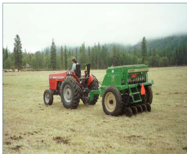
Landowners may rent the RCD's "No Till" Drill

Since we are locally based, we have the opportunity to work out local solutions to natural resource issues and thus avoid "solutions" imposed by outside regulation. We support a balance between utilization and conservation of our natural resources, and we are available to assist property owners to do the same. We are committed to finding local solutions to local natural resource issues.