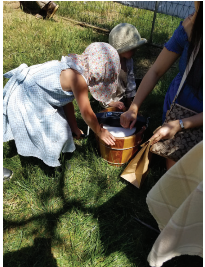
Hand cranked ice cream at the 2018 Frontier Day Festival