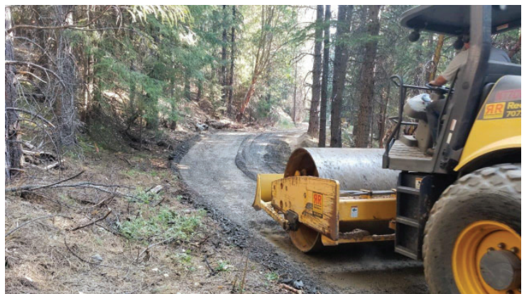
Construction, rocking, and compaction of a rolling dip