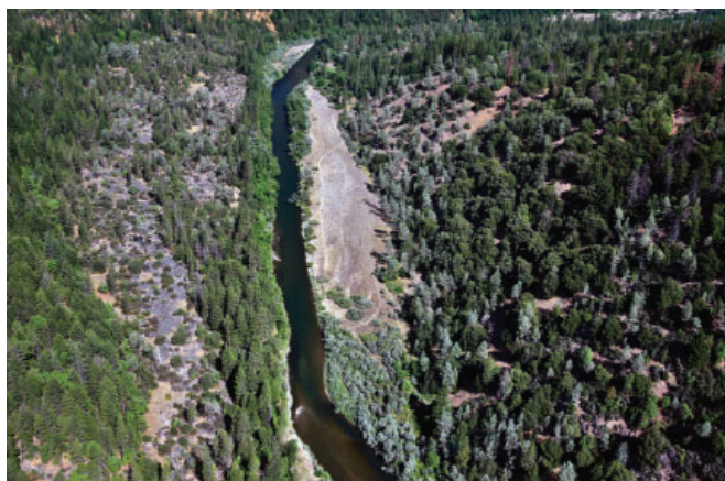
Photo 2. The Dutch Creek site, several miles from the Chapman Ranch site, is proposed for construction in the summer of 2020. This straight stretch of river is cut-off from the floodplain and offers little habitat for young fish, especially during higher flows

Please visit www.trrp.net for more information, technical reports, other products and links to partner and cooperator information.