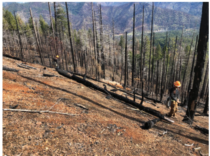
Hand broadcasting native grass seed