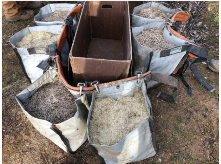
Native grass seed in bags ready for broadcasting

The District's Native Plant Nursery continued to expand in 2018, with generous support from Caltrans. Twenty-four different species of native seed were collected, treated, stratified, and propagated at the nursery, which added valuable diversity for revegetation projects. Plants grown from local seed are more adapted to the harsh climate, poor soils, and unique topography found in Trinity County, ultimately contributing to healthier and more resilient ecosystems.