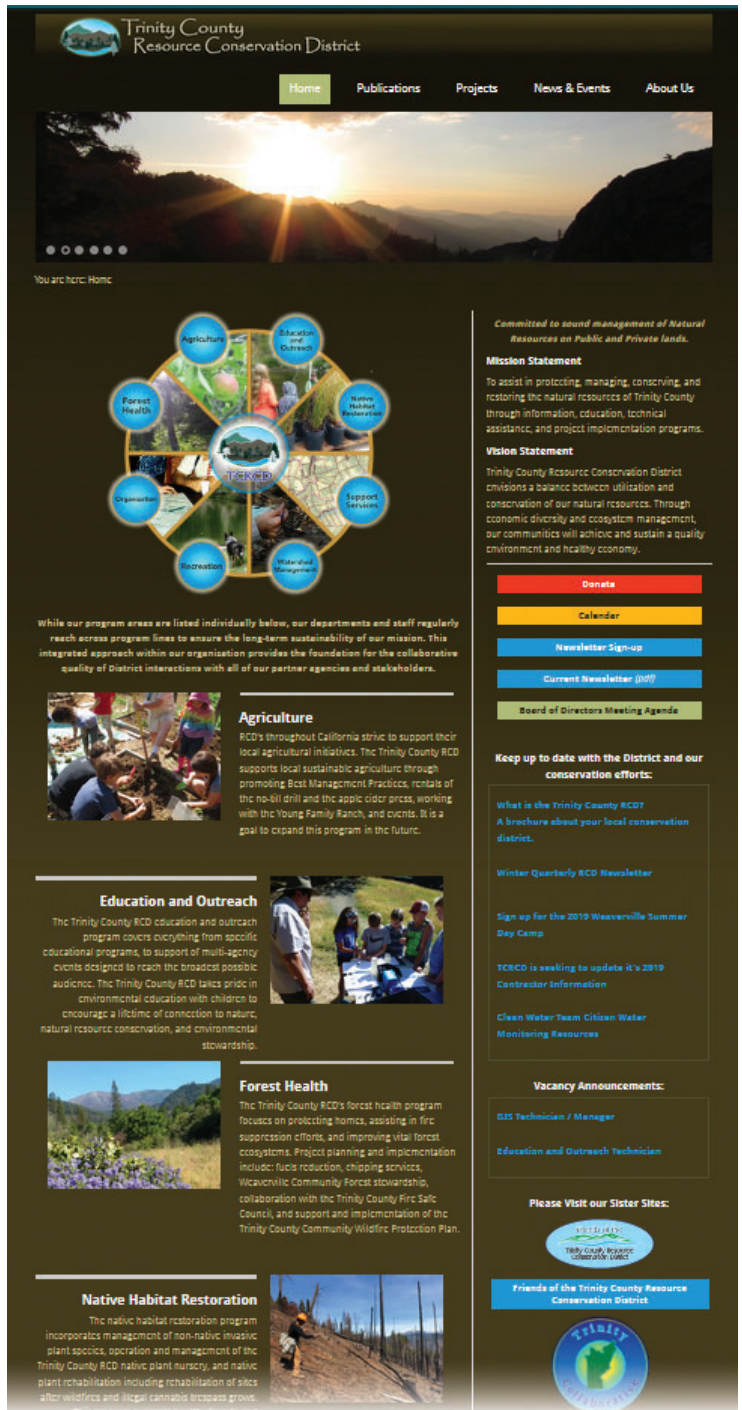
Redesign of the District's homepage