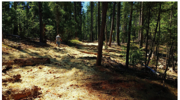
Road decommission on Browns Road