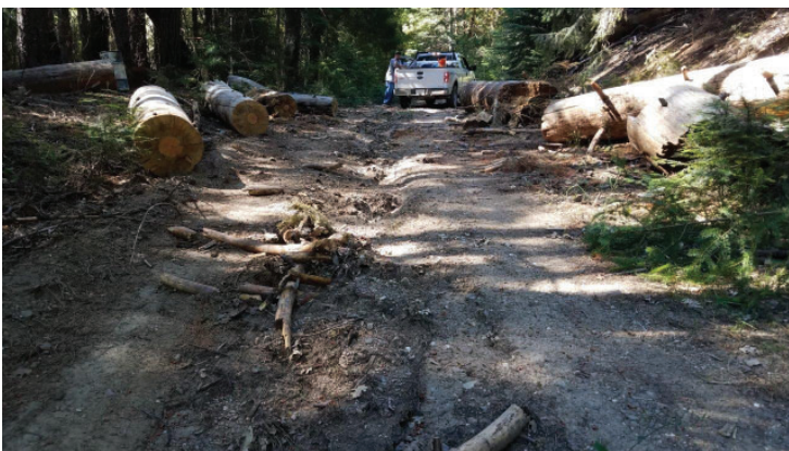
Gully from poor road drainage