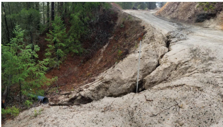
Gully erosion after the Carr Fire