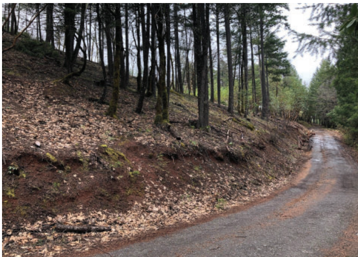
Roadside shaded fuel break along South Ridge Road in the Timber Ridge area of Weaverville

One excellent example of this is the Timber Ridge Community Fuel Break, a 30-acre contiguous project forming a protective buffer around the Timber Ridge subdivision in Weaverville. Once completed, it will provide an anchor point for fire suppression efforts in the Wildland Urban Interface south of Weaverville, and tie in with fuels reduction treatments the BLM is implementing in the Weaverville Community Forest.