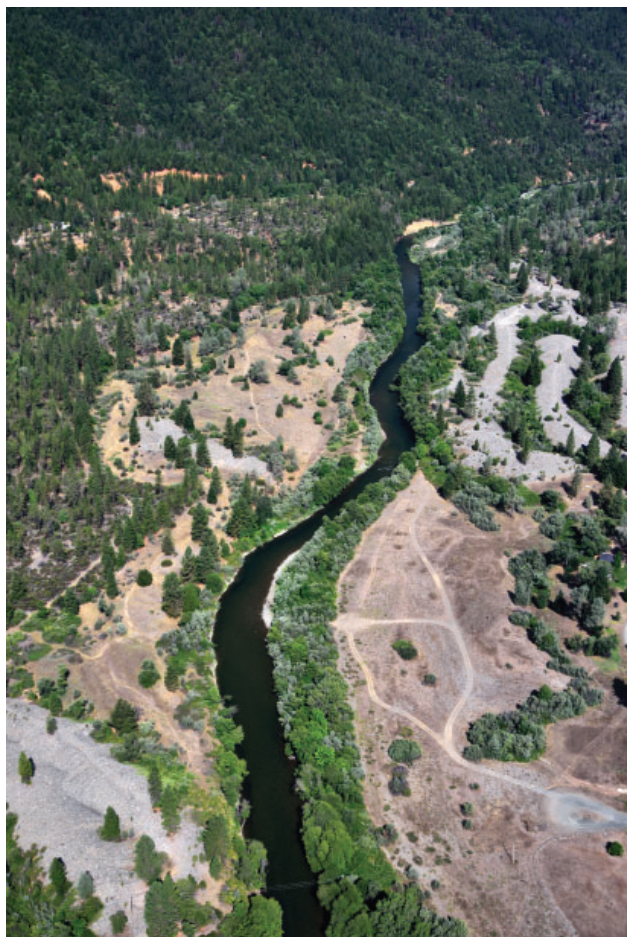
Photo 1. Aerial photograph of the Chapman Ranch site, which is proposed for construction in the summer of 2019

On a highly regulated and managed river like the Trinity River ecological disruption is unavoidable; But with focused and continued effort that works toward maintaining and recovering natural river processes, wild salmon and steelhead can return to the Trinity in strong numbers.