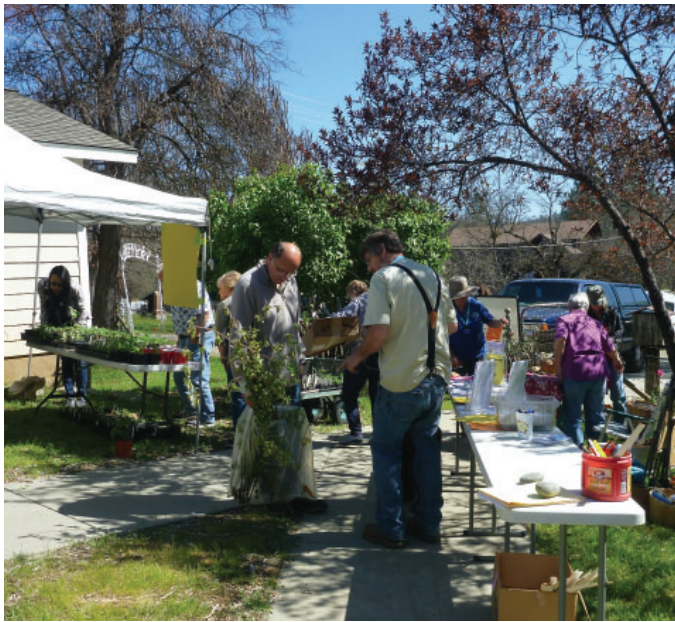
Annual Trinity County Plant and Seed Exchange

This would not have been possible without support from Trinity Trust, Humboldt Area Foundation, UC Cooperative Extension, UC Master Gardeners, UC CalFresh, Young Family Ranch volunteer Board of trustees, and many others who supported these events.