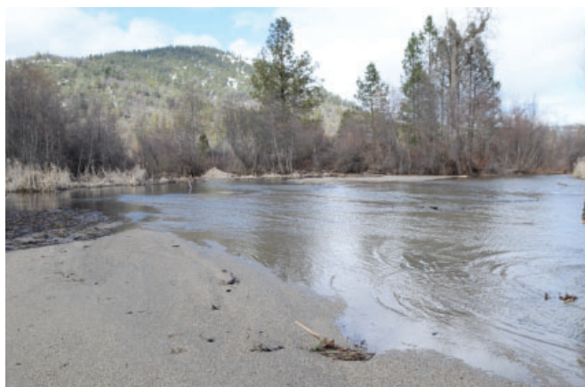
Photo 3. Hamilton Ponds were built to prevent decomposed granite and fine sediment from Grass Valley Creek from building up in the Trinity River