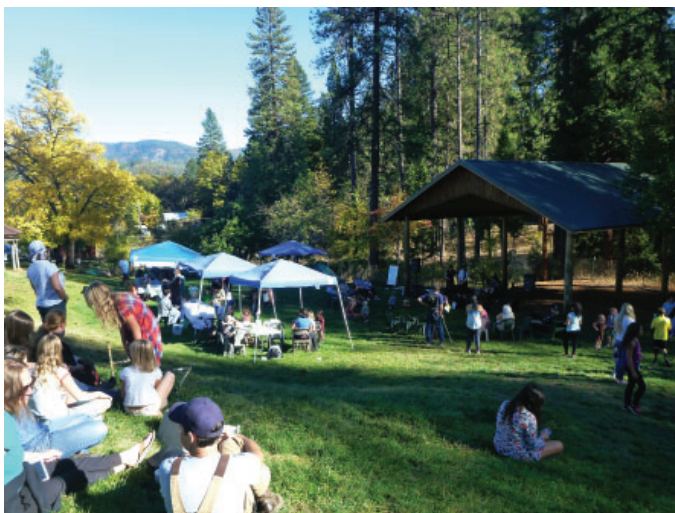
2018 Apple Festival