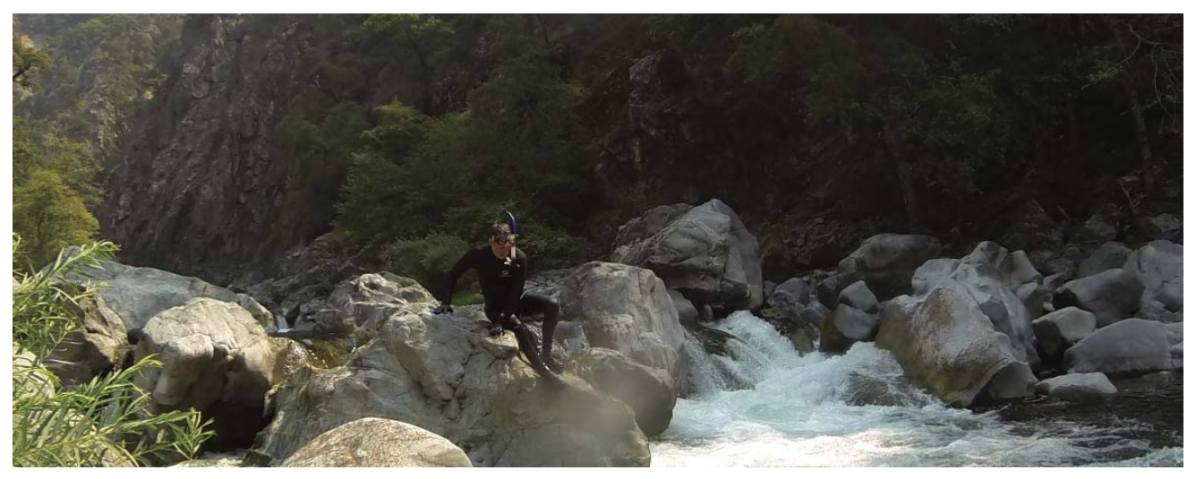
Participant navigating a survey reach on the New River.

years, told the assembled crews "the most dangerous thing you're going to do today is walk." As hip, knee, rib, and elbow bruises attest, the most hazardous part of the job can be walking in shallow water over slick river rock.