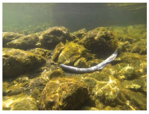
Dead lamprey on the South Fork Trinity River 8/16/2017.

Fortunately, as the largest undammed Wild and Scenic River in California, the South Fork Trinity River holds potential to rebound and support healthy runs of spring-run Chinook salmon. And much like the New River, the South Fork watershed is largely within public lands. Along with the dozens of summer adults in the Salmon River, the wild springrun Chinook salmon in the South Fork Trinity and New Rivers are some of the last remaining populations in the Klamath River watershed.