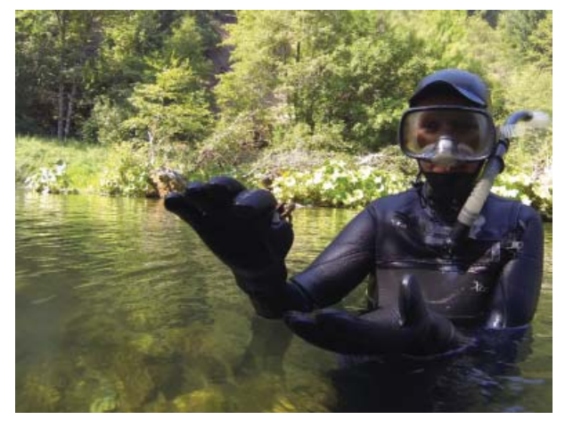
A foothill yellow-legged frog found during the snorkel survey.

Previously, it was thought that fall-run Chinook and winter steelhead could evolve to take the place of spring-run fish if they go extinct. However, early migrators may have increasing