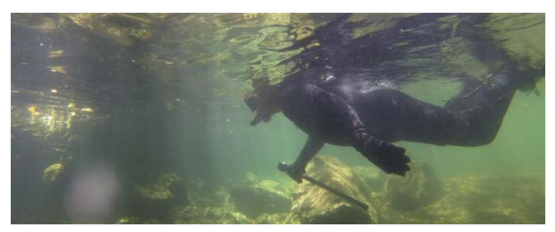
Survey participant snorkeling the South Fork Trinity River.

salmon ( Oncorhynchus tshawytscha ) and adult summer steelhead ( O. mykiss ). In addition to their ecological importance in the watersheds, early migrating salmon populations help sustain the recreational fishing industry and are essential to indigenous cultures in the region.