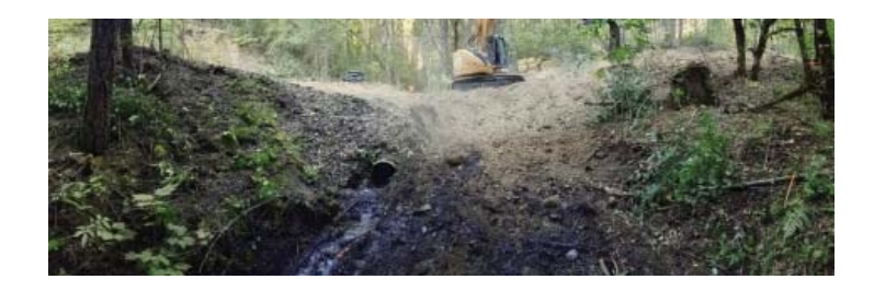
Road being removed, but culvert still intact.