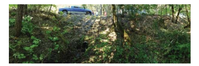
Note truck on road before decommissioning and culvert pipe below it.

Several roads were also decommissioned this summer: two in the Trinity/Lewiston Lake area and one near Stuarts Gap in the East Fork of the South Fork Trinity River. The roads were identified by the USFS through environmental assessment as roads to be removed from their system of roads; two of the three were impassable to vehicles due to brush or other reasons. After decommissioning, all disturbed areas were seeded and mulched; trees and riparian plants will be planted this fall or next spring to encourage stream channel recovery. This project will eliminate road failure risk and was funded by the CA OHV Commission and the Trinity County USFS RAC.