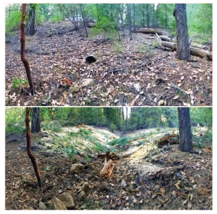
Each set of photos (above and below) show before and after images of decommissoned roads.