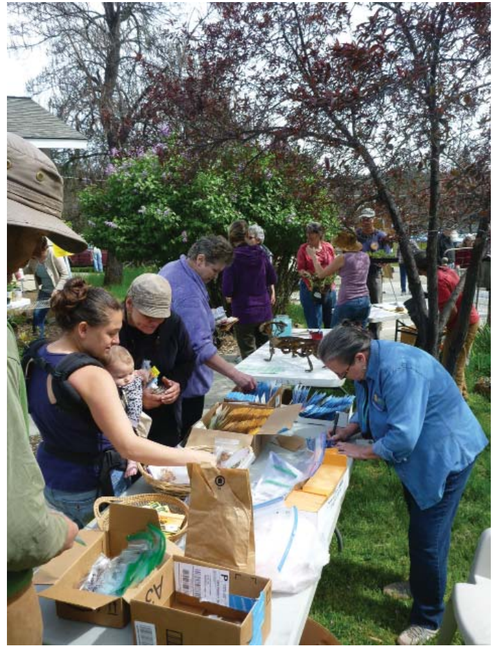
The seed table was a popular spot at the exchange.