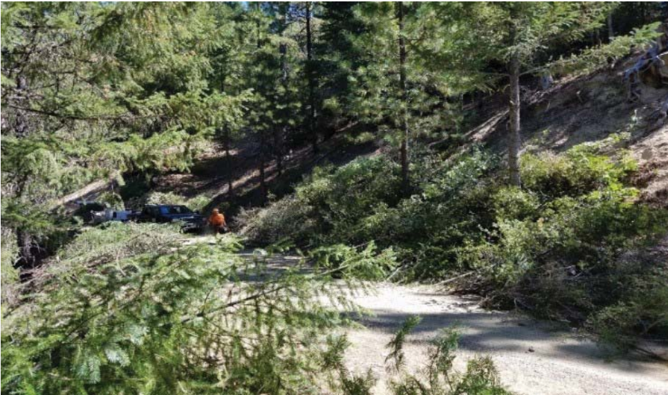
GVC Stewardship Shaded Fuel Break

Weaverville and at several project sites in the Hayfork vicinity. The prescription includes thinning to reduce fuel loads and ladder fuels. These fuels reduction projects will help lessen the very high risk of catastrophic fires due to buildup of fuel loads in these priority areas, and act as fuel breaks to protect communities and residences. The areas selected for fuels reduction were made with careful consideration based on the Trinity County CWPP project ranking and recommendations for strategic fuels reduction.