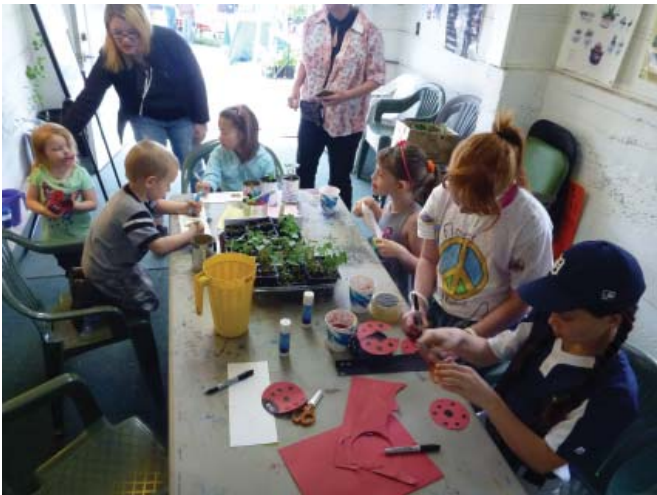
Children had fun making crafts and decorating containers for their very own plants to bring home.