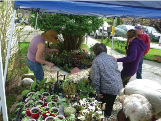
Houseplants, bedding flowers and vegetable starts were included in the ever changing mix of plants available on April 22.