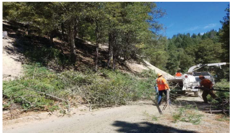
GVC Stewardship Shaded Fuel Break