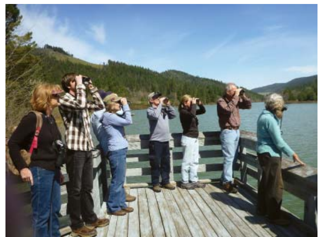
Birding Safari at Lewiston Lake