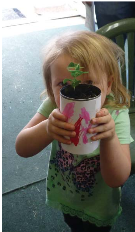
Children had fun planting and painting containers.