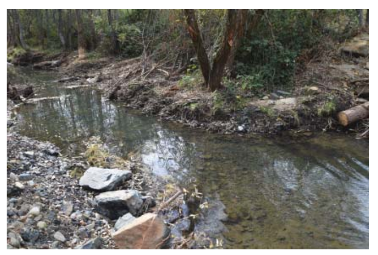
Constructed low flow side channel provides rearing habitat for juvenile salmon and steelhead.