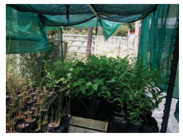
Willow and maple stock from locally collected plant material, propagated by TCRCD for use at restoration sites.

Invasive species management is critical to protecting habitat for native plants and wildlife. In 2015 TCRCD continued work on two long term noxious weed management projects funded by the USFS, and began work on a third. This was the fourth year of a five-year effort to control of Scotch broom ( Cytisus scoparius ) on private properties in Junction City. We also removed dyer's woad ( Isatis tinctoria ), around the Carville ponds. 2015 was our first year working on an inventory and treatment project for several noxious weed species for the USFS in the footprint of the Sims fire near Hyampom. In addition, the District continued to treat dyer's woad with funding from TRRP at the Upper and Lower Junction City sites, and along Sky Ranch Road. These populations of dyer's woad are especially important to treat as they are the lowest known occurrences along the Trinity River. The District