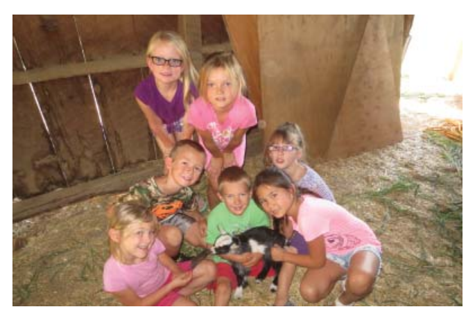
Day campers: Children at 2015 Weaverville Summer Day Camp.

During 2015 the Ranch garden produced one of the best crops in recent years thanks to the work and volunteer hours put in by the University of California Master Gardeners. The UC Cooperative Extension, sponsors of the Master Gardener program, along with the CalFresh Nutrition Education program, have offices at the Ranch. With the work of volunteers and District employees, the garden yielded over 500 pounds of produce. The squash, tomatoes, beans,