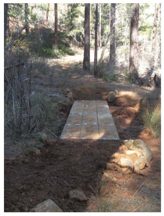
New foot bridge along Garden Gulch Spur Trail.

• Four foot bridges were installed along the Garden Gulch Spur Trail. The new bridges will help to reduce trail erosion in wet areas.