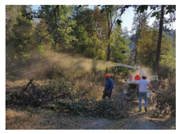
RCD crew on chipping project.

To protect, enhance, restore and revitalize the watershed through collaborative efforts that leverage external resources, work toward common goals, educate and engage community stakeholders, address natural resource issues, and support healthy ecosystems for future generations.