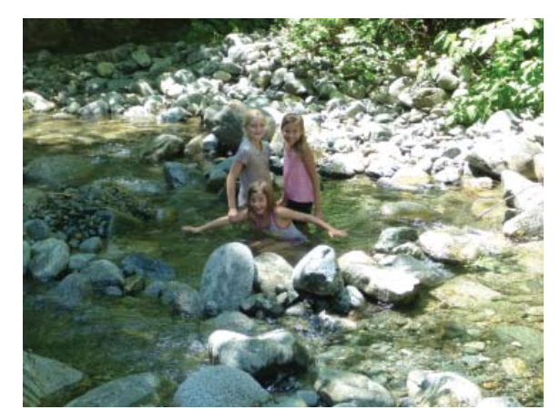
Summer day campers exploring Rush Creek.