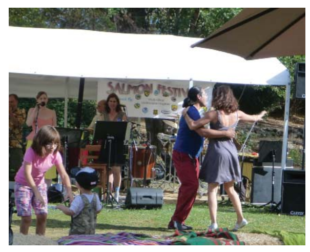
2015 Trinity River Salmon Festival.

• Three day, two night Environmental Science Camp for Weaverville sixth grade students at Bar 717 Ranch; and a one day camp for Hayfork sixth grade students, both sponsored by TRRP