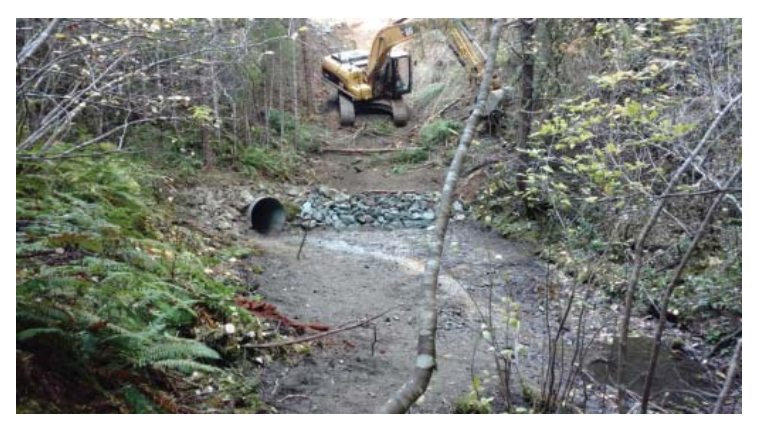
Inlet basin cleaned and rip rap placed at inlet of existing culvert.

Road - related Sediment Reduction Projects, cont.