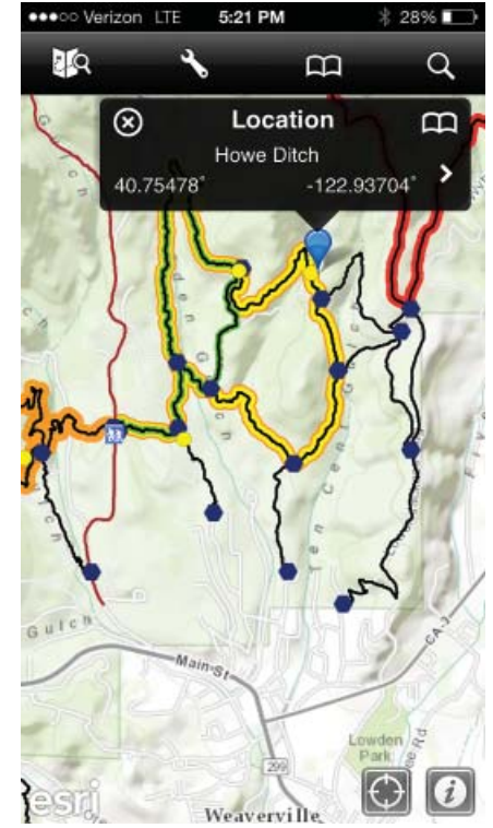
Weaver Basin Trail System mobile app.

Lewiston, Douglas City, Junction City, Hawkins Bar, and Salyer were completed in 2015, with the remainder of the county to be finalized in 2015.