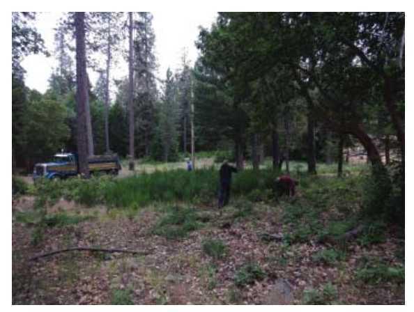
TCRCD employees tackle a large patch of Scotch broom, on private property off of Senger Road in Junction City.

The District provides weed wrenches and tree planting tools that Trinity County residents may borrow for work on their own properties. For more information on borrowing a tool or how to obtain native plants from our nursery or native grass seed, please call our office.