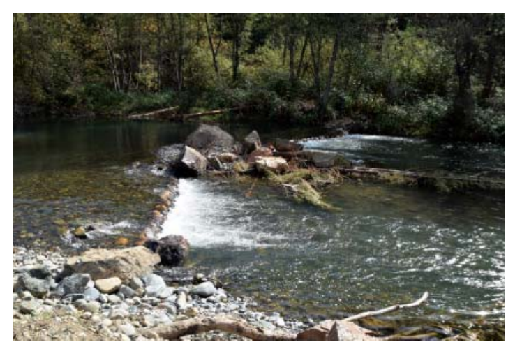
Main channel boulder and large wood structure create habitat diversity and refuge during high flows.

The success of the TRRP in restoring native fish populations depends upon many elements. External factors such as ocean health, climate change, and watershed conditions affect physical and biological functions that can deplete fish populations, despite the quality of newly restored habitat. The perception of natural processes, inherently slow to respond to management actions, can be misleading to those who observe little change over the short term. However the benefits of river restoration are becoming more evident as the TRRP continues into its 16th year, using variable flows, mechanical actions, and adaptive management methods designed to bring back a healthy fishery and more sustainable, high-quality riparian habitat.