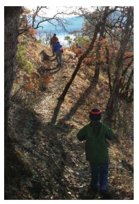
Hikers on Jackass Ridge Trail.

The Weaverville Community Forest is an award-winning partnership between the BLM, the US Forest Service and the Trinity County RCD to manage 13,000 acres of federal land as a community forest. Using a federal contracting tool called Stewardship Contracting, the agreements provide a framework for cooperation between the parties in support of the trail system. Trail projects were funded in part by grants from the Secure Rural Schools and Community Self Determination Act, through the Trinity County Resource Advisory Committee (RAC).