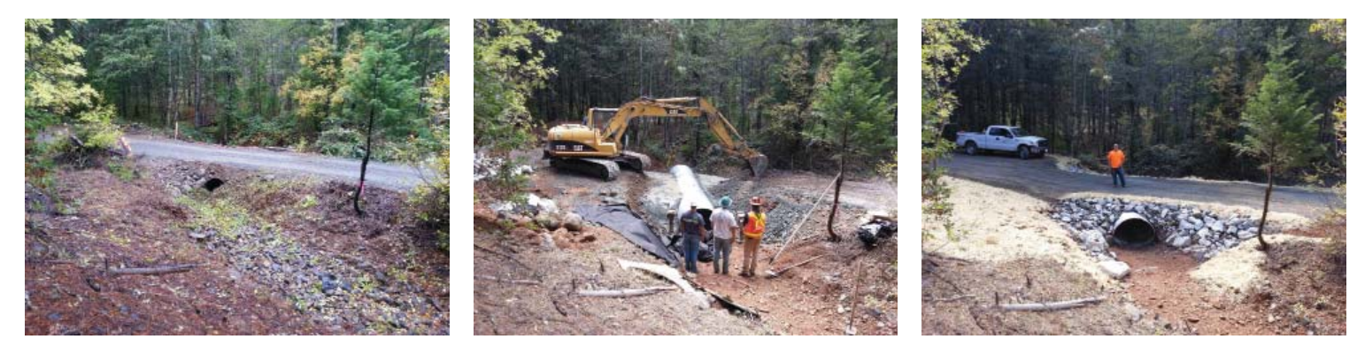
Road upgrade on Blue Rock Road, before, during and after.

Funding for the TCRCD road-related projects in 2013 came from the Trinity River Restoration Program, USFS, BLM, Trinity County Resource Advisory Committee, State Water Resources Control Board, and the California OHV Commission. The TCRCD is here to assist Trinity County landowners - so please contact the District if you need more information or assistance with your road-related issues.