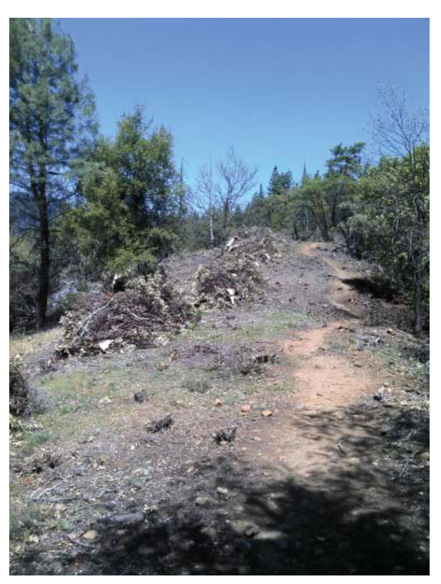
Removed fuels are hand-piled for burning on Musser Hill.

Musser Hill: This large fuels reduction project, also in the WCF but on USFS land, included three separate phases on Musser Hill. This project included thinning, pruning, hand piling, and covering piles to improve forest health and increase wildfire resiliency by reducing fuel loads. A total of 148 acres of fuels reduction on Musser Hill was implemented to prepare for a wildlife prescribed burn to enhance the quantity and quality of deer browse. This project was funded by the Trinity County Resource Advisory Committee with funds from the USFS. It met all of the purposes of the Secure Rural Schools Act, in that the project implements stewardship objectives which enhance forest ecosystems and restores and improves land health and water quality.